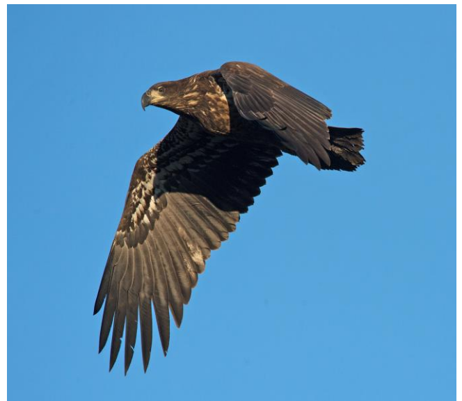
Juvenile Bald Eagle